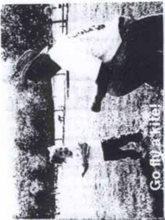
Go fly a kite!